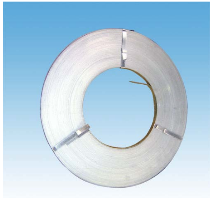
Zinc Plated Strapping